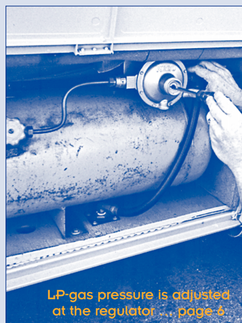
LP-gas pressure is adjusted at the regulator ... page 6