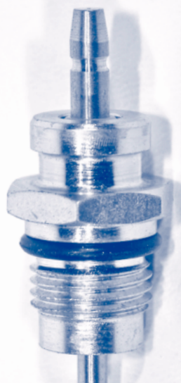
This isn't a Burger King Whopper, but have it your way ... page 6