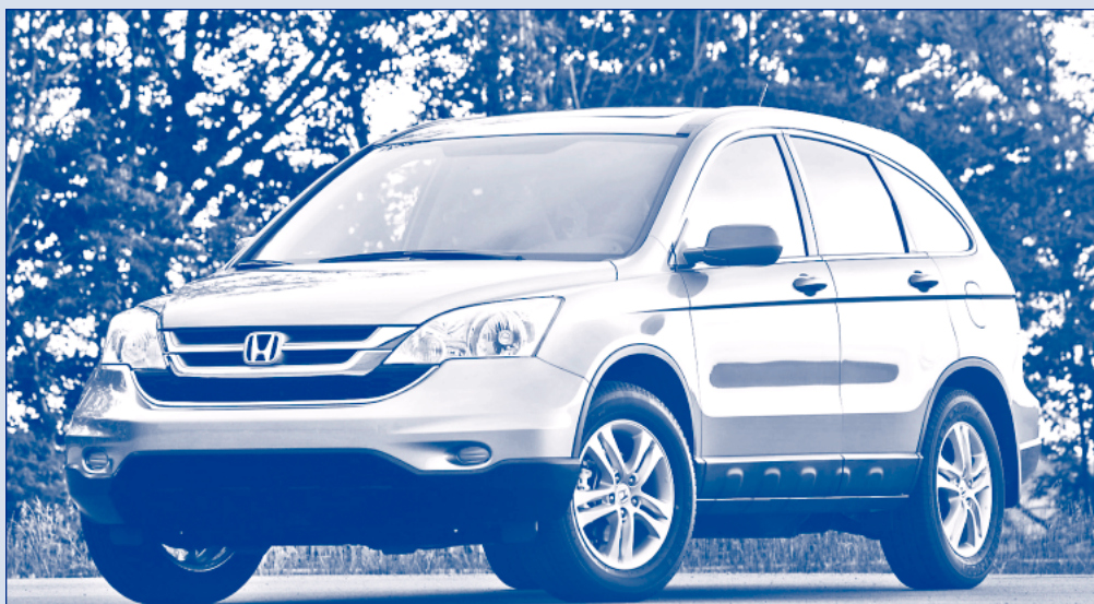
A heavy 4x4 towed vehicle with an automatic transmission, but ... page 3